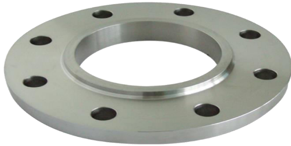
TABLE 3 AWWA C207 CLASS D HUB FLANGES